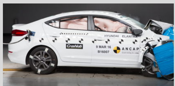
Frontal offset test at 64km/h (Hyundai Elantra)